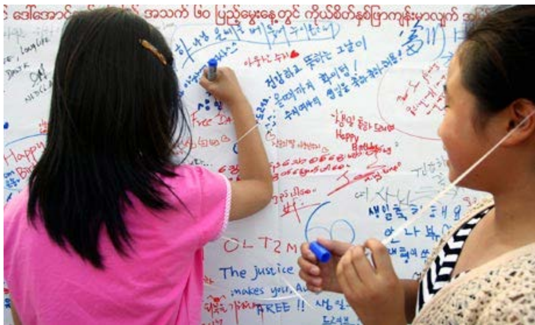
Free expression... South Korean students write birthday messages to Aung San Suu Kyi during a protest against Burma's military regime.

At this weekend's session of the Edinburgh World Writers' conference in Kuala Lumpur, the eminent Burmese writer – imprisoned under censorship laws for more than five years – used her own experience to reflect on censorship and imagination. This is an edited version of her keynote speech,